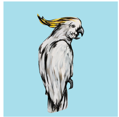
Sulphur Crested Cockatoo