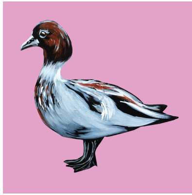
Australian Wood Duck